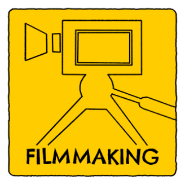
July 19-23, 9am-5pm Ages 10-18