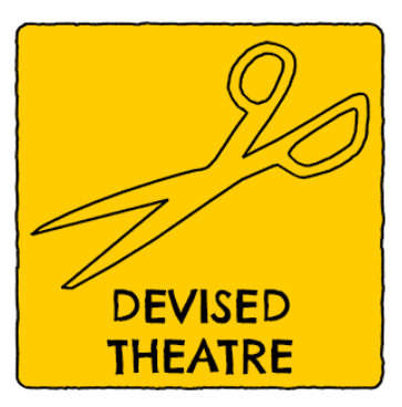
July 26-30, 9am-12pm Ages 12-22