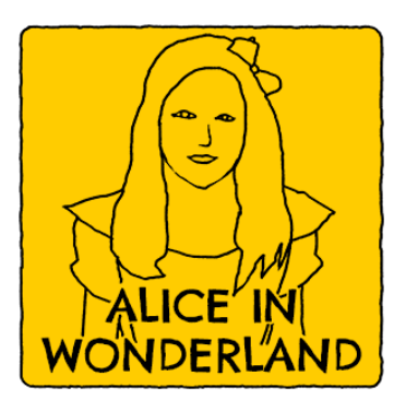
August 2-6, 9am-12pm Ages 5-12