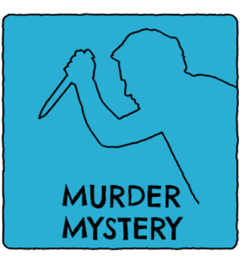
July 5-9, 1pm-5pm Ages 8-15 (Virtual)