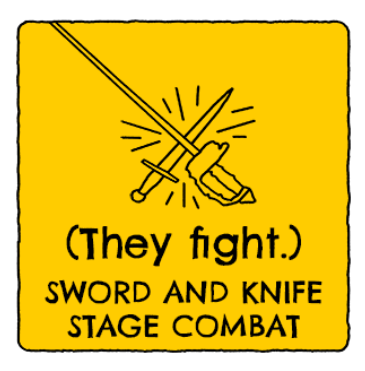
July 26-30, 1pm-5pm Ages 12-18