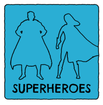
July 5-9, 9am-12pm Ages 5-12 (Virtual)