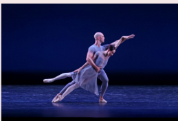
featuring Stars of American Ballet

Join Chamberlain Ballet for an exciting program of diverse dance works, woven to create a rich fabric of artistic expression.